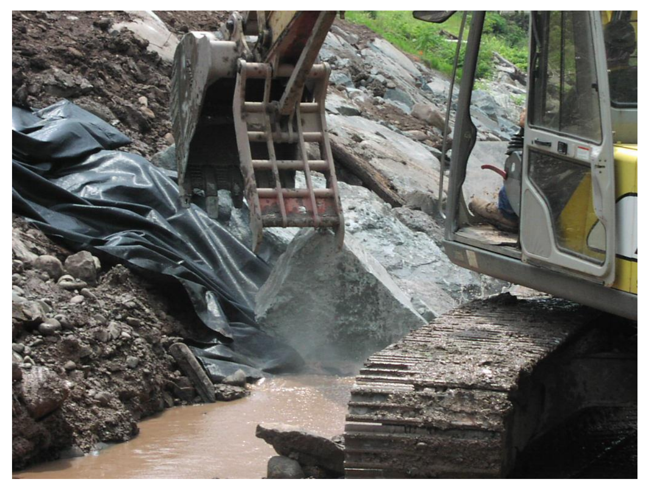
Placing stone in key trench.