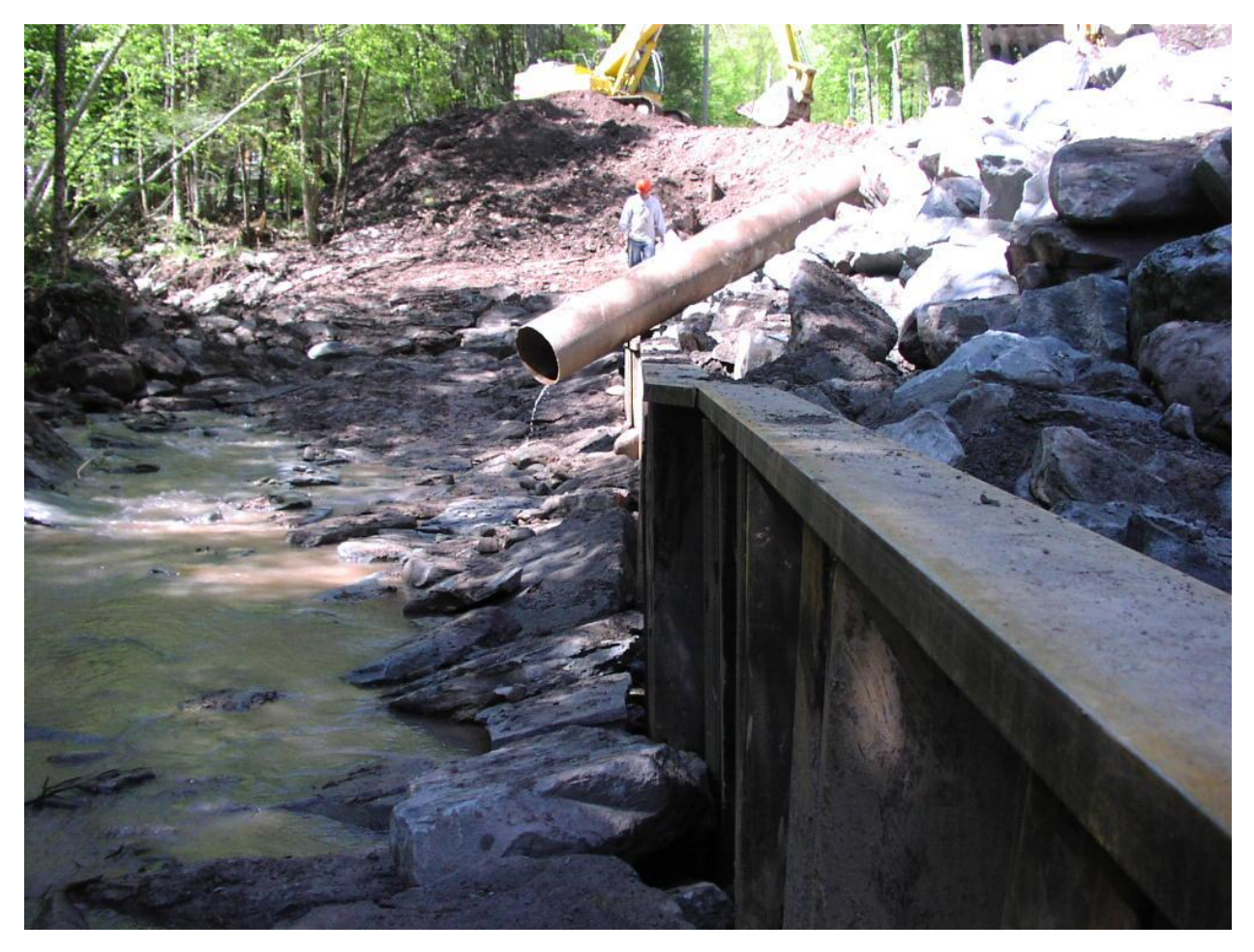
Completed Sheet Piling