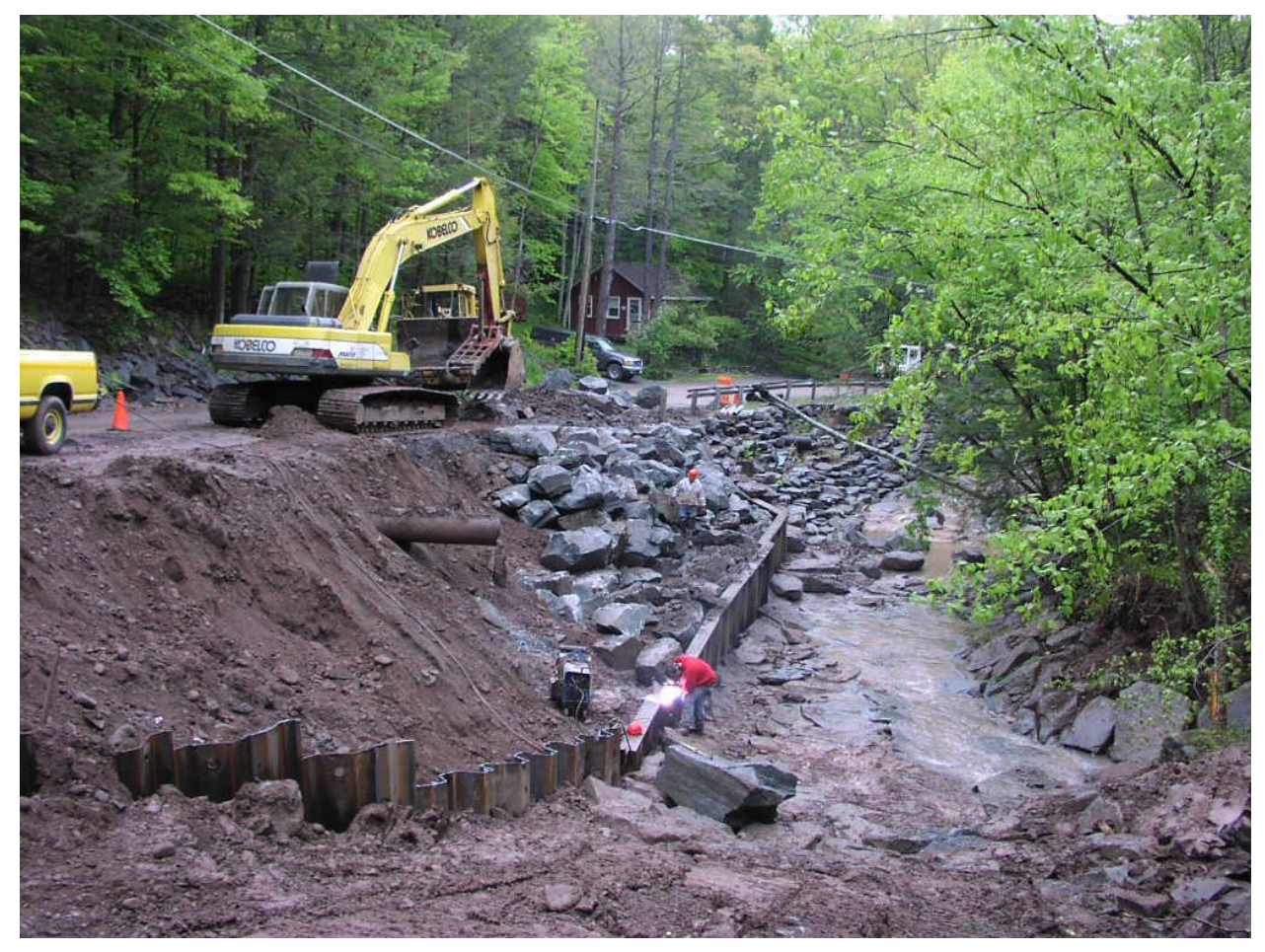
Welding Sheet Piling