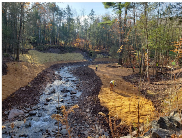
The Panther Kill restoration site showing turbidity loading from bank and hillslope erosion (left photo) and completed restoration project with grade control, bank stabilization and clear mountain stream water (right photo).