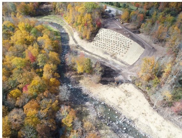
Hillslope failure and bank erosion (left photo) and stabilized hillslope and stream channel realignment (right photo) at Stony Clove Creek restoration site.